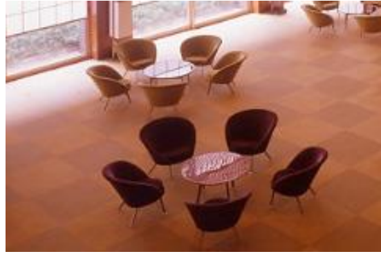
Lacquered tables and chairs