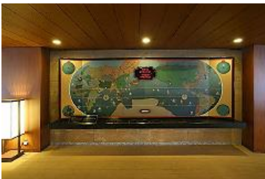
World map and clock displaying global time zones