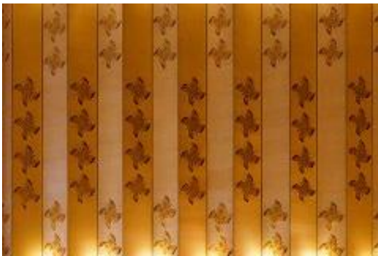
Hanging wall tapestry Four Petal Flowers