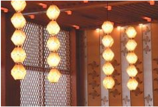
Okura Lantern ceiling lights