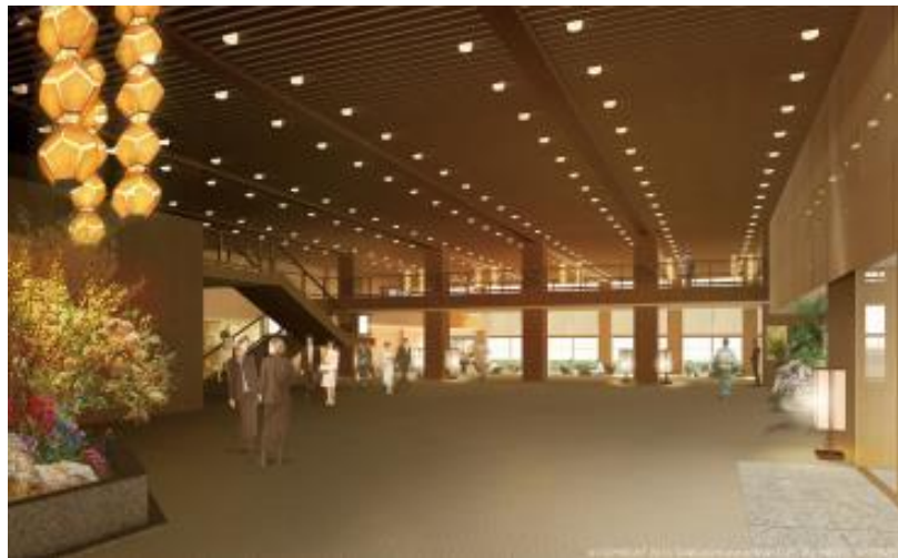
Rendition of Hotel Okura Tokyo's new main lobby

Decorations from the original facility that will grace the new lobby include the distinctive hexagonal Okura Lantern ceiling lights, lacquered tables and chairs arranged like plum flowers, world map and clock displaying global time zones, and the quietly elegant andon standing paper lamps.